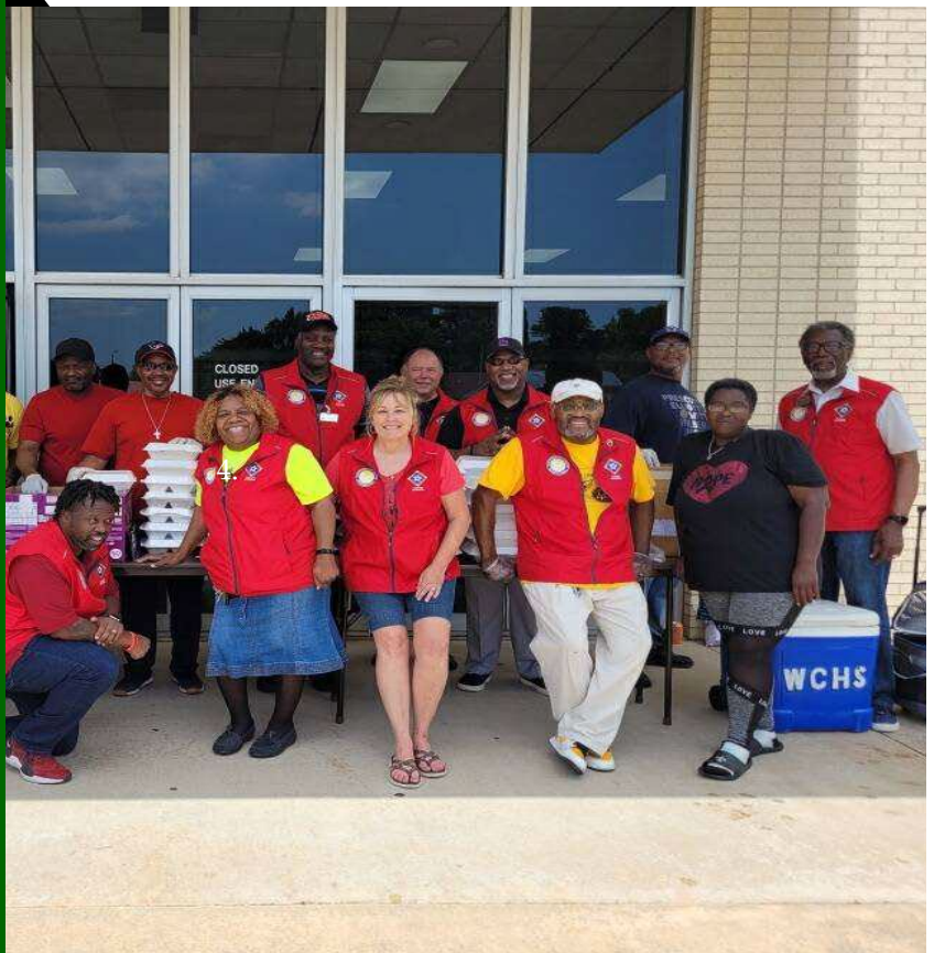
PEN OR PENCIL MENTORS IN PINE BLUFF, ARKANSAS

Mentors assist youth in their escape from new methods of psychological, physical, mental and any form of enslavement that might place their minds and futures in bondage. They serve as conductors in helping to guide youthful freedom seekers to new opportunities and to the full measure of their potential.